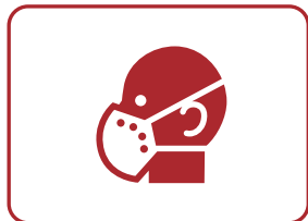
986 N95 Mask