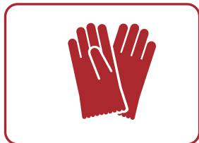
930 boxes of Surgical & Examination Gloves