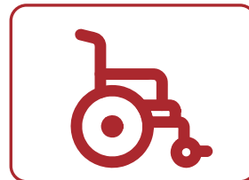
39 persons with spinal injury supported with medical devices