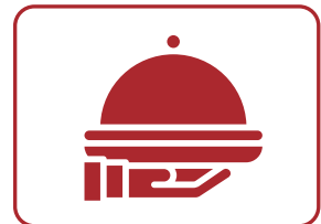
Food Items provided to marginalized families and families of persons with disabilities