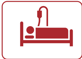
2 ICU Bed