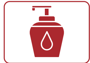
556 ltrs Sanitizer