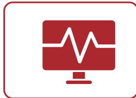
1 Cardiac Monitor